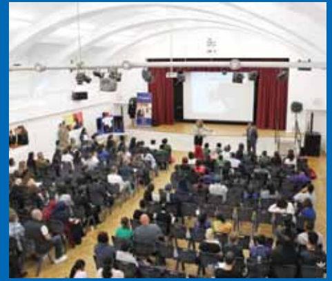
YEAR 6 STUDENTS WHO HAVE NOW STARTED AT HESTON ENJOY THEIR TRANSITION DAY