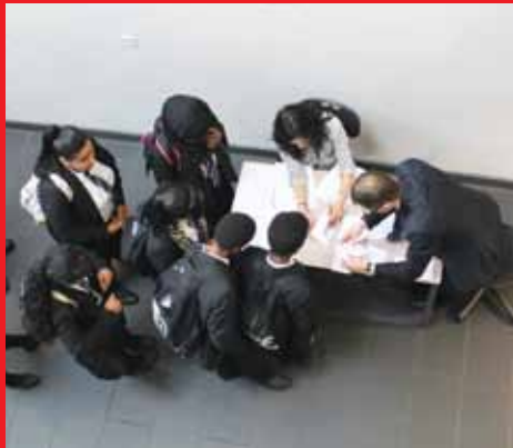
YEAR 9 VOTE TO STAY IN EUROPE BUT ONLY BY TWO VOTES