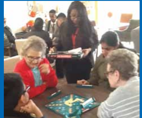
SIXTH FORM STUDENTS VISITED PARK LODGE HOUSE WITH GAMES & DELICIOUS TREATS