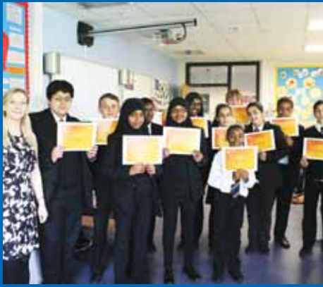
GREAT WORK FROM THE "A TEAM" & THEY MADE AFTERNOON TEA FOR PARENTS & TEACHERS TOO