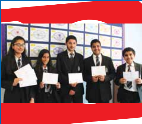
JUNIOR MATHS CHALLENGE YEAR 8 AWARD WINNERS GET CERTIFICATES & PIZZA!