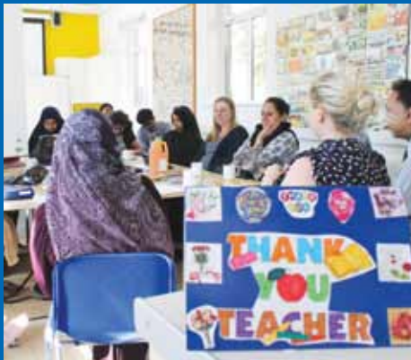
COFFEE CLUB PARENTS DELIVERED A THANK YOU CARD AT THE FINAL COFFEE MORNING OF THE YEAR