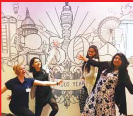
YEAR 11 BT MENTORING STUDENTS GRADUATE & CELEBRATE AT BT TOWERS