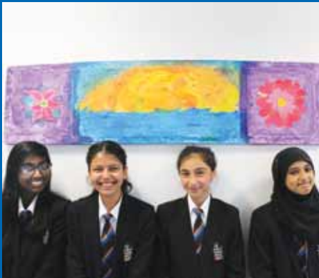
THE HOGARTH GALLERY SHOWCASED YEAR 7 & 8'S CHINESE SILK ARTWORK