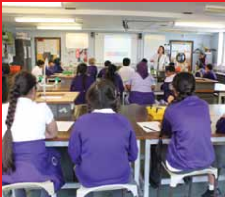
HESTON PRIMARY SCHOOL ENJOYED SCIENCE & TECHNOLOGY TASTER SESSIONS