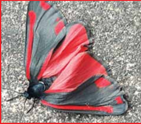
WELL DONE PRIYA 8Y WILDLIFE PHOTOGRAPHY COMPETITION WINNER