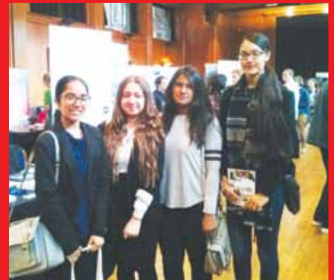
YEAR 12 LEARN ABOUT BIOLOGICAL SCIENCE DEGREES AT THE ROYAL COLLEGE OF SURGEONS