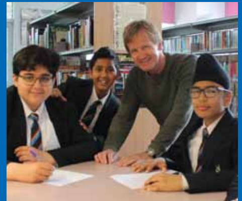
PERFORMANCE POET STEVE TASANE RAPS TO YEAR 7 & TAKES WORKSHOPS