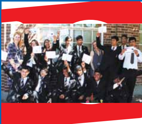
EAL STUDENTS RECEIVED AWARDS FOR THEIR EXCELLENT WORK THROUGHOUT THE YEAR