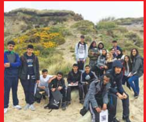
YEAR 10 GEOGRAPHERS STUDIED FLOOD DEFENCES, BEACHES & CLIFFS IN DORSET