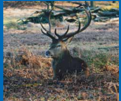
CONGRATULATIONS EBONY 80 WILDLIFE PHOTOGRAPHY COMPETITION WINNER