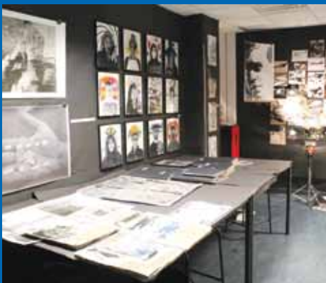
STUNNING 'A' LEVEL SCULPTURE, PHOTOGRAPHY, DESIGN & ART IMPRESS VISITORS