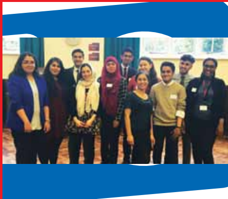
“ARTICULATE & CREATIVE” YEAR 12 POLICY LEAGUE STUDENTS IMPRESS AT CITY UNIVERSITY