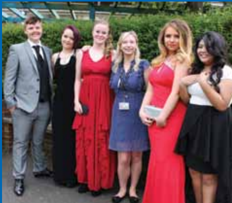
YEAR 11 PROM – AMAZING OUTFITS & A FIRE ALARM TOO!