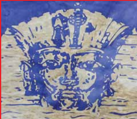
“LIKE WALKING ROUND A TOP LONDON GALLERY” – GCSE ART EXHIBITION